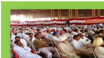
Farmers Fair and Meetings