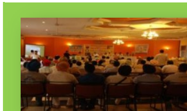
Seminar and Workshops