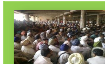
Addressing the Local issues