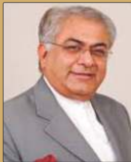
CHAIRMAN Organising Committee