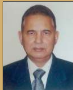
CO-CHAIRMAN Organising Committee

Chairman, EM3 Services P. Limited and Chairman, ICFA Working Group on Mechanisation